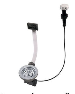
Automatic waste fitting 8407 000