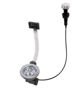
Automatic waste fitting 8407 100